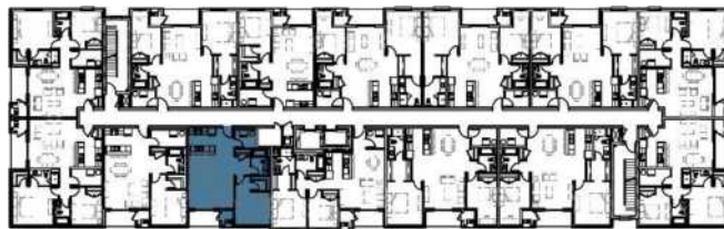
Suite 301, 501 & 601

*PLANS ARE NOT TO SCALE AND ARE SUBJECT TO ARCHITECTURAL REVIEW AND REVISIONS, INCLUDING, WITHOUT LIMITATION, THE UNITS SHOWN MAY BE THE REVERSE OF THE UNIT PURCHASED. * FURNITURE AND KITCHEN ISLANDS DISPLAYED ARE NOT TO SCALE AND SHOWN FOR ILLUSTRATION PURPOSES ONLY AND DO NOT NECESSARILY REFLECT THE ELECTRICAL PLAN OF THE SUITE. SUITES ARE SOLD UNFURNISHED. ALL MATERIALS, SPECIFICATIONS, FLOORPLANS, DETAILS, STATED AREAS AND DIMENSIONS, IF ANY, ARE APPROXIMATED, AND ARE SUBJECT TO CHANGE WITHOUT NOTICE IN ORDER TO COMPLY WITH BUILDING SITE CONDITIONS, MUNICIPAL, STRUCTURAL, VENDOR AND/OR ARCHITECTURAL REQUIREMENTS AS WELL AS NORMAL CONSTRUCTION VARIANCES. DIMENSIONS MAY EXCEED THE USABLE FLOOR AREA. ACTUAL USABLE FLOOR SPACE MAY VARY FROM STATED FLOOR AREA IN ACCORDANCE WITH BULLETIN 22 ISSUED BY THE TARIION WARRANTY CORPORATION. BULKHEADS ARE NOT SHOWN ON THIS PLAN AND MAY BE LOCATED IN AREAS OF THE UNIT AS REQUIRED TO PROVIDE VENTING, MECHANICAL, UTILITY, SERVICING AND OTHER SYSTEMS. BALCONIES AND TERRACES WHERE APPLICABLE ARE SHOWN FOR DISPLAY PURPOSES ONLY AND LOCATIONS AND SIZE ARE SUBJECT TO CHANGE WITHOUT NOTICE. ALL RENDERINGS AND ILLUSTRATIONS ARE ARTIST CONCEPT AND ARE FOR ILLUSTRATION PURPOSES AND ARE SUBJECT TO CHANGE BY THE DEVELOPER AND THE PURCHASER AGREES TO ACCEPT AND CHANGE. THE SIZE, TYPE AND LOCATIONS OF WINDOWS ARE SUBJECT TO CHANGE AND WILL VARY PER FLOOR. ALL ILLUSTRATIONS ARE ARTIST'S CONCEPT ONLY. E. & O. E. JULY 2022