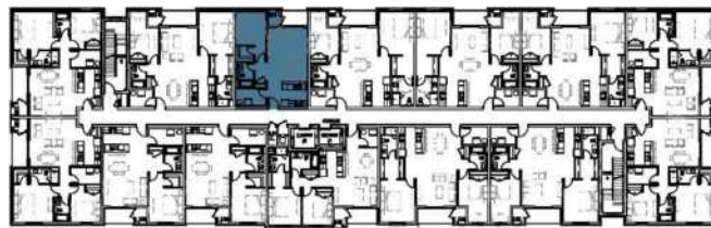
Suite 206 & 306

*PLANS ARE NOT TO SCALE AND ARE SUBJECT TO ARCHITECTURAL REVIEW AND REVISIONS, INCLUDING, WITHOUT LIMITATION, THE UNITS SHOWN MAY BE THE REVERSE OF THE UNIT PURCHASED. * FURNITURE AND KITCHEN ISLANDS DISPLAYED ARE NOT TO SCALE AND SHOWN FOR ILLUSTRATION PURPOSES ONLY AND DO NOT NECESSARILY REFLECT THE ELECTRICAL PLAN OF THE SUITE. SUITES ARE SOLD UNFURNISHED. ALL MATERIALS, SPECIFICATIONS, FLOORPLANS, DETAILS, STATED AREAS AND DIMENSIONS, IF ANY, ARE APPROXIMATED, AND ARE SUBJECT TO CHANGE WITHOUT NOTICE IN ORDER TO COMPLY WITH BUILDING SITE CONDITIONS, MUNICIPAL, STRUCTURAL, VENDOR AND/OR ARCHITECTURAL REQUIREMENTS AS WELL AS NORMAL CONSTRUCTION VARIANCES. DIMENSIONS MAY EXCEED THE USABLE FLOOR AREA. ACTUAL USABLE FLOOR SPACE MAY VARY FROM STATED FLOOR AREA IN ACCORDANCE WITH BULLETIN 22 ISSUED BY THE TARIION WARRANTY CORPORATION. BULKHEADS ARE NOT SHOWN ON THIS PLAN AND MAY BE LOCATED IN AREAS OF THE UNIT AS REQUIRED TO PROVIDE VENTING, MECHANICAL, UTILITY, SERVICING AND OTHER SYSTEMS. BALCONIES AND TERRACES WHERE APPLICABLE ARE SHOWN FOR DISPLAY PURPOSES ONLY AND LOCATIONS AND SIZE ARE SUBJECT TO CHANGE WITHOUT NOTICE. ALL RENDERINGS AND ILLUSTRATIONS ARE ARTIST CONCEPT AND ARE FOR ILLUSTRATION PURPOSES AND ARE SUBJECT TO CHANGE BY THE DEVELOPER AND THE PURCHASER AGREES TO ACCEPT AND CHANGE. THE SIZE, TYPE AND LOCATIONS OF WINDOWS ARE SUBJECT TO CHANGE AND WILL VARY PER FLOOR. ALL ILLUSTRATIONS ARE ARTIST'S CONCEPT ONLY. E. & O. E. JULY 2022