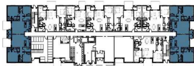
Suite 101, 102, 108 & 109

*PLANS ARE NOT TO SCALE AND ARE SUBJECT TO ARCHITECTURAL REVIEW AND REVISIONS, INCLUDING, WITHOUT LIMITATION, THE UNITS SHOWN MAY BE THE REVERSE OF THE UNIT PURCHASED. * FURNITURE AND KITCHEN ISLANDS DISPLAYED ARE NOT TO SCALE AND SHOWN FOR ILLUSTRATION PURPOSES ONLY AND DO NOT NECESSARILY REFLECT THE ELECTRICAL PLAN OF THE SUITE. SUITES ARE SOLD UNFURNISHED. ALL MATERIALS, SPECIFICATIONS, FLOORPLANS, DETAILS, STATED AREAS AND DIMENSIONS, IF ANY, ARE APPROXIMATED, AND ARE SUBJECT TO CHANGE WITHOUT NOTICE IN ORDER TO COMPLY WITH BUILDING SITE CONDITIONS, MUNICIPAL, STRUCTURAL, VENDOR AND/OR ARCHITECTURAL REQUIREMENTS AS WELL AS NORMAL CONSTRUCTION VARIANCES. DIMENSIONS MAY EXCEED THE USABLE FLOOR AREA. ACTUAL USABLE FLOOR SPACE MAY VARY FROM STATED FLOOR AREA IN ACCORDANCE WITH BULLETIN 22 ISSUED BY THE TARIION WARRANTY CORPORATION. BULKHEADS ARE NOT SHOWN ON THIS PLAN AND MAY BE LOCATED IN AREAS OF THE UNIT AS REQUIRED TO PROVIDE VENTING, MECHANICAL, UTILITY, SERVICING AND OTHER SYSTEMS. BALCONIES AND TERRACES WHERE APPLICABLE ARE SHOWN FOR DISPLAY PURPOSES ONLY AND LOCATIONS AND SIZE ARE SUBJECT TO CHANGE WITHOUT NOTICE. ALL RENDERINGS AND ILLUSTRATIONS ARE ARTIST CONCEPT AND ARE FOR ILLUSTRATION PURPOSES AND ARE SUBJECT TO CHANGE BY THE DEVELOPER AND THE PURCHASER AGREES TO ACCEPT AND CHANGE. THE SIZE, TYPE AND LOCATIONS OF WINDOWS ARE SUBJECT TO CHANGE AND WILL VARY PER FLOOR. ALL ILLUSTRATIONS ARE ARTIST'S CONCEPT ONLY. E. & O. E. JULY 2022