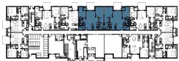
Suite 105 & 106 (Barrier Free)

*PLANS ARE NOT TO SCALE AND ARE SUBJECT TO ARCHITECTURAL REVIEW AND REVISIONS, INCLUDING, WITHOUT LIMITATION, THE UNITS SHOWN MAY BE THE REVERSE OF THE UNIT PURCHASED. * FURNITURE AND KITCHEN ISLANDS DISPLAYED ARE NOT TO SCALE AND SHOWN FOR ILLUSTRATION PURPOSES ONLY AND DO NOT NECESSARILY REFLECT THE ELECTRICAL PLAN OF THE SUITE. SUITES ARE SOLD UNFURNISHED. ALL MATERIALS, SPECIFICATIONS, FLOORPLANS, DETAILS, STATED AREAS AND DIMENSIONS, IF ANY, ARE APPROXIMATED, AND ARE SUBJECT TO CHANGE WITHOUT NOTICE IN ORDER TO COMPLY WITH BUILDING SITE CONDITIONS, MUNICIPAL, STRUCTURAL, VENDOR AND/OR ARCHITECTURAL REQUIREMENTS AS WELL AS NORMAL CONSTRUCTION VARIANCES. DIMENSIONS MAY EXCEED THE USABLE FLOOR AREA. ACTUAL USABLE FLOOR SPACE MAY VARY FROM STATED FLOOR AREA IN ACCORDANCE WITH BULLETIN 22 ISSUED BY THE TARIION WARRANTY CORPORATION. BULKHEADS ARE NOT SHOWN ON THIS PLAN AND MAY BE LOCATED IN AREAS OF THE UNIT AS REQUIRED TO PROVIDE VENTING, MECHANICAL, UTILITY, SERVICING AND OTHER SYSTEMS. BALCONIES AND TERRACES WHERE APPLICABLE ARE SHOWN FOR DISPLAY PURPOSES ONLY AND LOCATIONS AND SIZE ARE SUBJECT TO CHANGE WITHOUT NOTICE. ALL RENDERINGS AND ILLUSTRATIONS ARE ARTIST CONCEPT AND ARE FOR ILLUSTRATION PURPOSES AND ARE SUBJECT TO CHANGE BY THE DEVELOPER AND THE PURCHASER AGREES TO ACCEPT AND CHANGE. THE SIZE, TYPE AND LOCATIONS OF WINDOWS ARE SUBJECT TO CHANGE AND WILL VARY PER FLOOR. ALL ILLUSTRATIONS ARE ARTIST'S CONCEPT ONLY. E. & O. E. JULY 2022